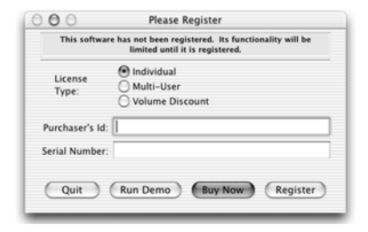
Figure 1: Registration Dialog

Quit – to quit the program, click the "Quit" button