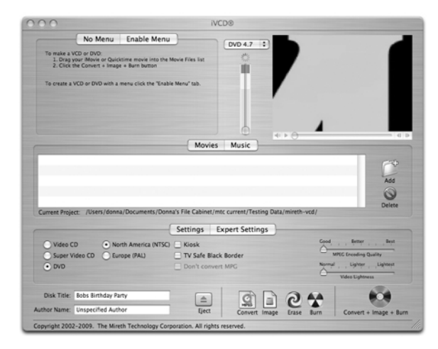
Figure 2: iVCD Main Screen

The iVCD<sup>TM</sup> project window consists of seven parts,