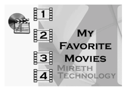
Figure 4: Menu Movie

The menu movie should display what buttons you have programmed and what they do. In our example, we would remove the "My favorite movies" text, replacing it with a description and perhaps a picture from each of the four movies.